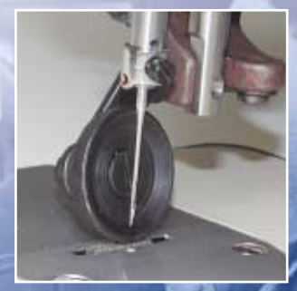
Machines equipped with 22 mm or 28 mm presser roller are designed for sewing leather and technical material products. Model GF-111-107 HR.

Sewing start with wiper engaged. The thread end is pulled into the backside of sewn product.