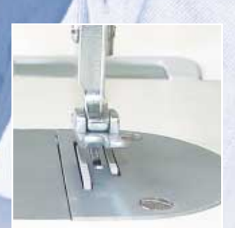
Machines with 3-line feed dog and needle plate with enlarged needle hole are designed for sewing heavy materials. Model GF 111-107 H.